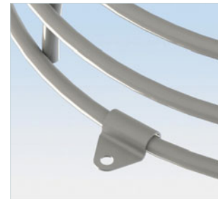
Supplied with heavy duty easy install quick fit clamps and screws