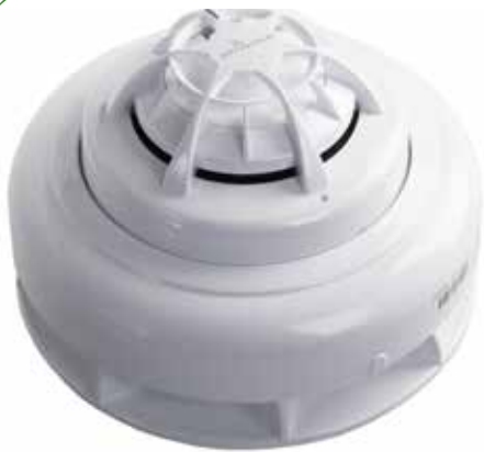
XPA-CB-14019-APO XPander Combined Sounder and Multisensor Detector