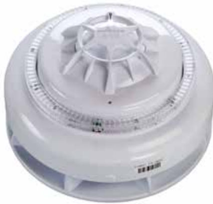
XPA-CB-14025-APO XPander Combined Sounder Visual Indicator (Clear) and Heat Detector (Class A1R)