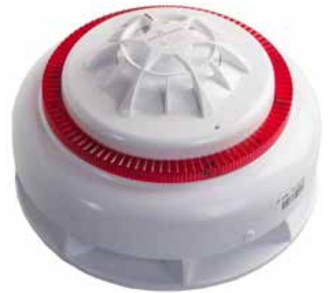
XPA-CB-14021-APO Combined Sounder Visual Indicator (Red) and Heat Smoke Detector