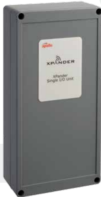
XPA-IN-14011-APO XPander Input/Output Unit