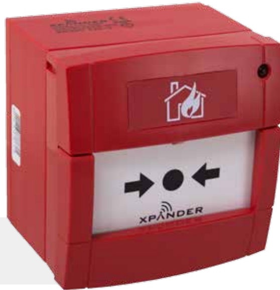
XPA-MC-14006-APO XPander Manual Call Point