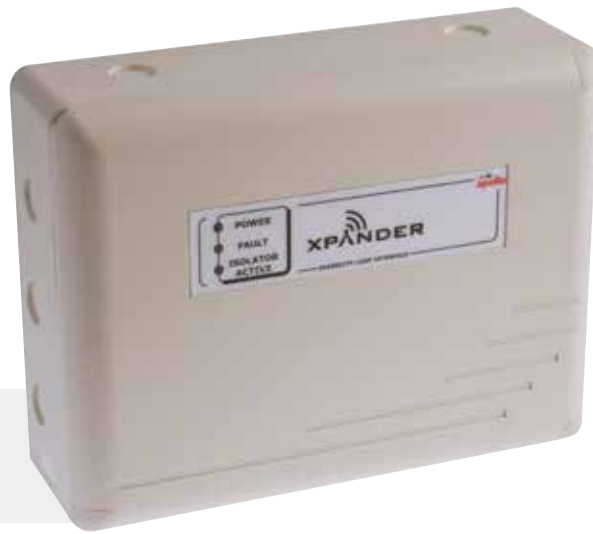
XPA-IN-14050-APO XPander Diversity Loop Interface